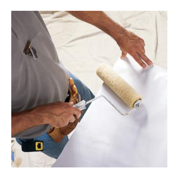
dry for a few days.

Paint strippers have long been caustic and toxic, but a new generation of paint strippers is now available that are water-soluble, noncaustic, and nontoxic. They are more expensive and take longer to work, but are really the only safe way to remove paint in a house with birds.